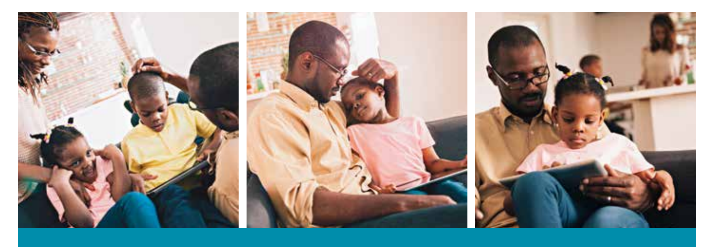
¡VOLTEE PARA ESPAÑOL! | WINTER 2018