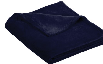
Throw blanket – This velvet-feel navy blanket is extra thick, measuring 50 X 60 inches. 100% polyester, fully hemmed.