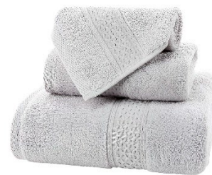
3-piece bath towel set – Light gray in color, this 100% cotton towel set includes a bath towel, hand towel, and wash rag.