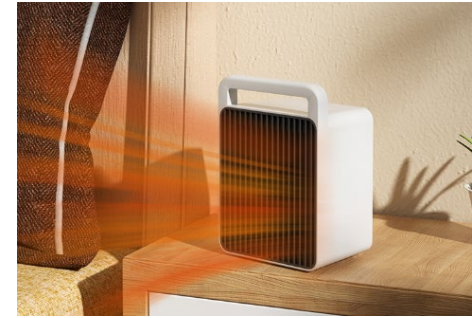
Safe space heater – With enough power to heat a room, this electric heater automatically shuts off if it is tipped over.