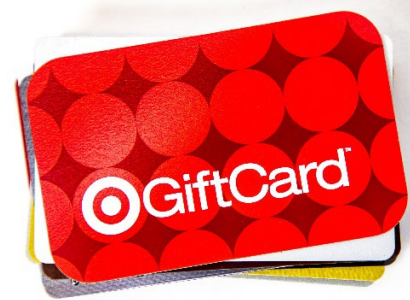
$25 gift card – Target