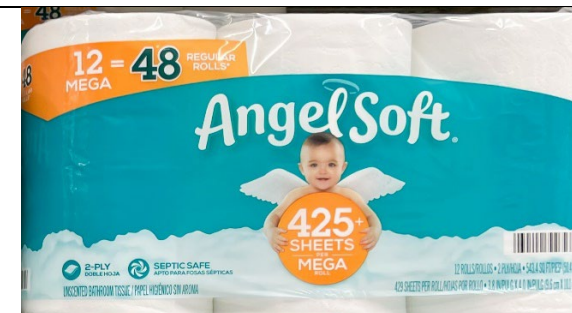
Angel Soft – 12 mega-rolls, equal to 48 regular rolls of toilet paper. Each roll has 320 sheets of soft 2-ply tissue.