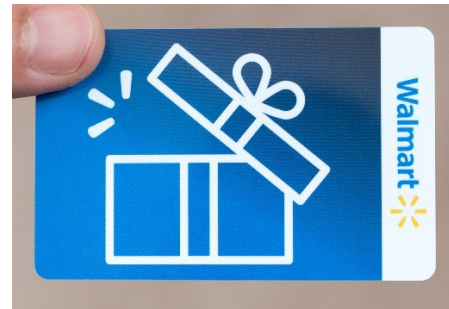
$25 gift card – Walmart