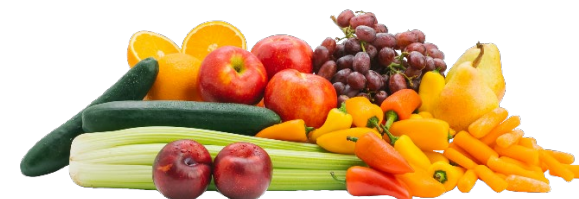
Farmbox Snacking Box – Fresh fruits and vegetables, perfect for healthy snacking. Contents vary each season.