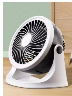
Table fan – Measuring 8.5 inches, this electric fan offers relief on a hot day and fits well on most tabletops.